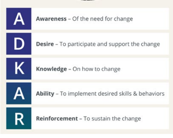
Figure 3: The Prosci ADKAR Model [3]

With any technological change, we must care for the tools, the processes, the documentation, and most importantly, the people. Organizational change management has become part of our standard project practice and has been well-received by the teams we serve. Our teams have been utilizing the Prosci ADKAR Model (Awareness, Desire, Knowledge, Ability, Reinforcement) for a few years now with impressive results. This powerful model is based on the understanding that organizational change can only happen when individuals change. The ADKAR Model focuses on individual change—guiding individuals through a particular change and addressing any roadblocks or barrier points along the way [3]. We have found that investing time upfront to understand the impact on our people and to develop plans that care for those impacts, enables an improved implementation experience and is time well spent.