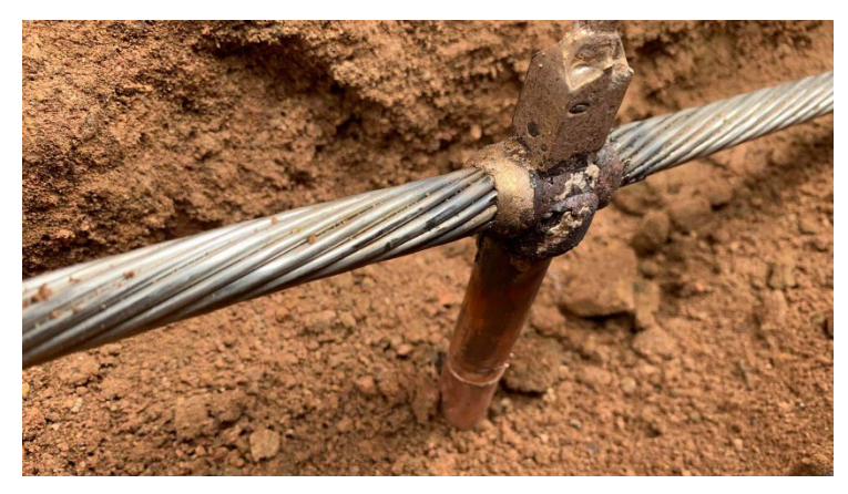
Figure 1 – Exterior Ground Ring Conductor Exothermically Welded To A Ground Rod

Finally, ANSI/SCTE 275 gives direction for the proper grounding of exterior objects like towers, guy wires, satellite dishes, masts, fencing and other metallic objects, all of which should be tied to the external ground ring.