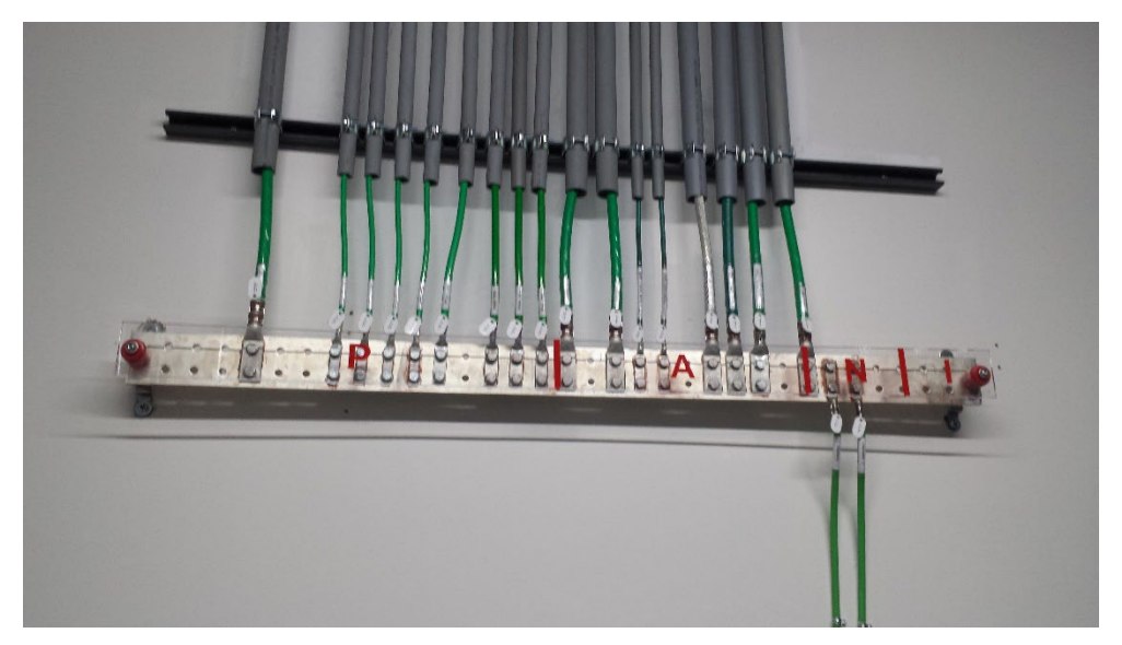
Figure 3 – Master Ground Bar With PANI Configuration

Finally, proper connections and cable sizing of the conductors terminated to the MGB help to achieve network reliability by increasing the resilience of the grounding system to ensure it will protect the operational integrity of the equipment and infrastructure within the critical facility.