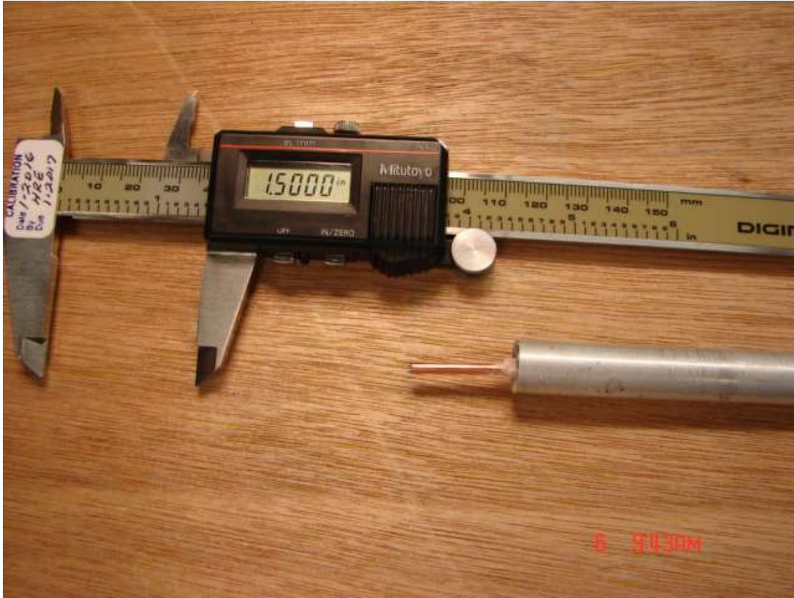
Figure 2 – Example Core Depth