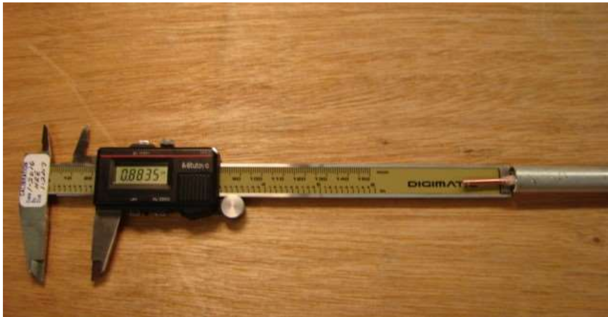
Figure 3 – Example Core Depth