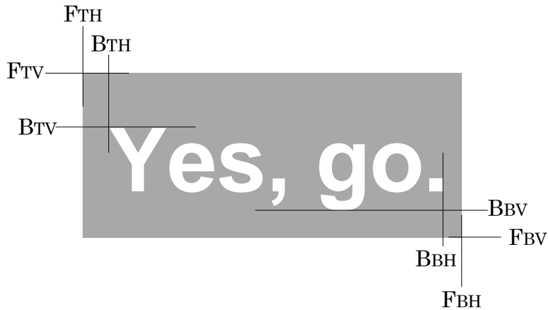
Figure 4.1. Placement of Bitmaps and Frames

There shall be FTH \leq BTH , FTV \leq BTV , FBH \geq BBH , and FBV \geq BBV .