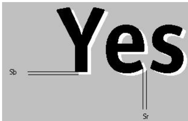
Figure 3.2. Example Drop Shadow

Figure 3.3 shows an example of outlined text. For outlines the line thickness is specified.