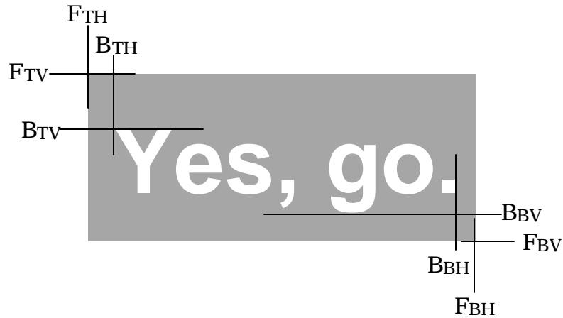
Figure 3.1. Placement of Bitmaps and Frames