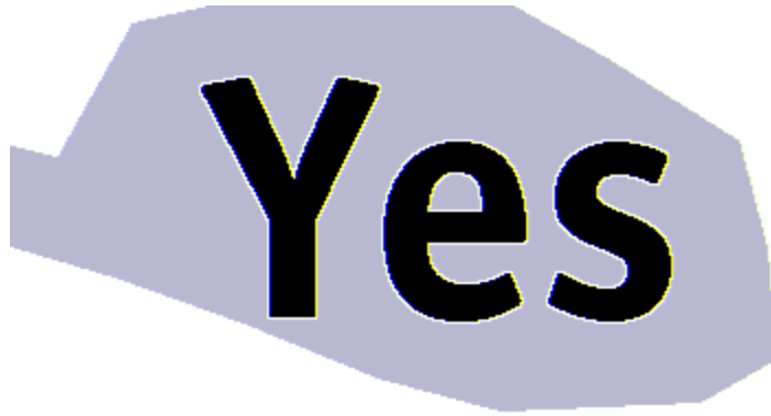
Figure 3.3. Example Outline